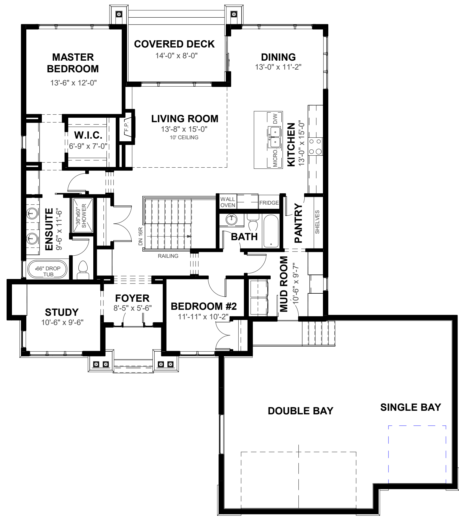
1 MAIN FLOOR PLAN 1/8" = 1'-0"